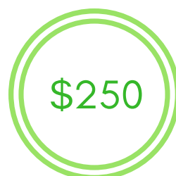
Table Sponsor(s) – Rudolph Level